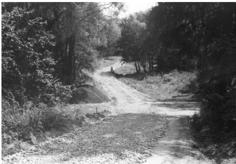
Figure 2 – The quality of the access road does not encourage easy cycling in Gyűrűfű

At any rate, it must be stated that a rural setting, as an offset, requires more movement. Additionally, local agricultural production does not solve the problem of shopping traffic. In the case of Gyűrűfű , the much publicised community supported agriculture model (CSA) (FISHER, A. 2002) does not seem to work. Inhabitants decide for themselves whether or not they set up a little kitchen garden which usually does not produce enough for selling and the design of the village site,